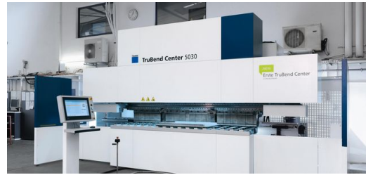
Since December of 2014 the first TruBend Center, built by TRUMPF, has been on site at Bickel Blechtechnik. There it makes for previously unconceivable diversity in the parts it produces.