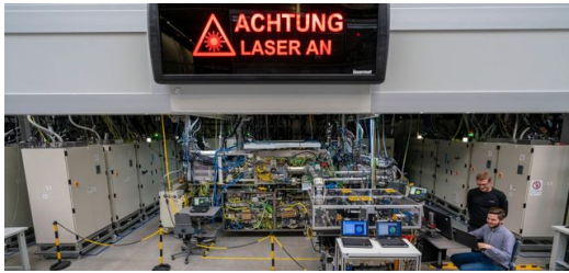
Commissioning of a TRUMPF EUV laser system in an installation bay.