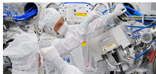
ASML employees in the clean room of the company in Veldhoven, Netherlands.