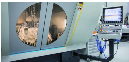
A Zeiss system grinds and polishes a mirror for EUV production.