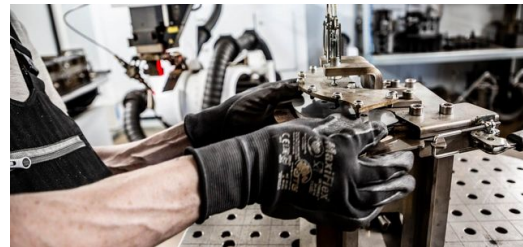
Kempf’s managing directors used success bonuses to encourage their employees to identify parts suitable for automated laser welding. This boosted their motivation, and now even fixture construction is easy.