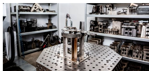
<p>Even with simple sheet metal fixtures, components can be clamped in