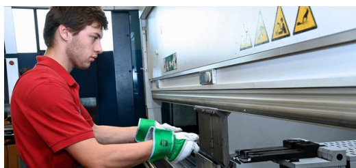
Assistance systems and software help with the work: The TruBend 5230 in use at the Fischer company.