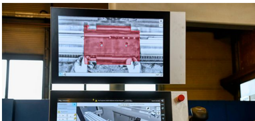
The Part Indicator in action: The system immediately shows whether the bending part is positioned correctly or incorrectly. Red means there is still an error here.

"The ACB Laser works with very high accuracy," says Fischer. Whether thin or thick sheet, a batch size of 1 or series parts, "If you load the program, the process runs." The operator uses the ACB Laser optical system for angle measurement without having to retool. A duo of laser and camera each travel independently along the desired bend. The laser projects a corresponding line onto the bending part, and the camera recognizes the line and calculates the angle of the part in real time.