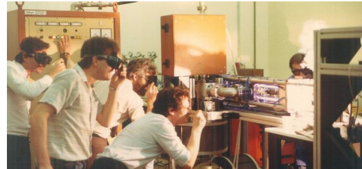
TRUMPF builds its first own CO 2 -Laser in 1985, the TLF 1000. It has a laser power of 1 Kilowatt and is the first compact laser resonator with RF-excitation.