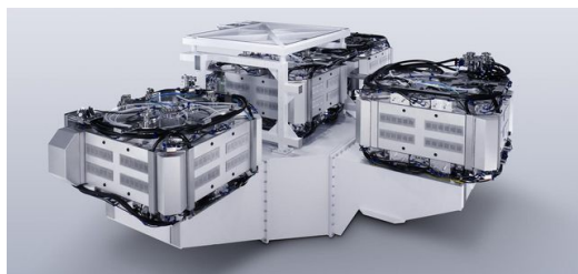
The TRUMPF laser amplifier, a pulse-type CO 2 laser system, delivers the laser pulse for the EUV project.