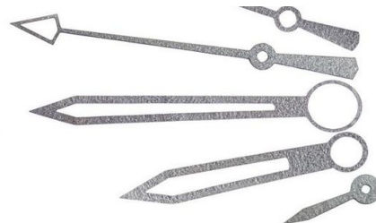
Cutting to specification with an ultrashort pulse laser: watch hands made of 0.05 millimeter thick stainless steel. The slotted recesses provide space for a subsequent application of fluorescent material.