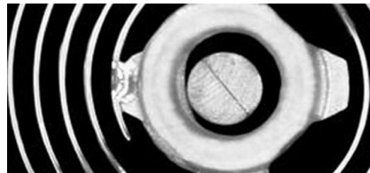
The welding spot has a diameter of 0.2 millimeters.