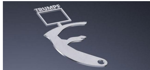
The variety of materials in precision cutting applications ranges from stainless steel – as seen here – to copper alloys and synthetic rubies for jewel bearings.