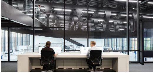
The Industry 4.0 offerings at TRUMPF are all subsumed under the name TruConnect. All the key TruConnect modules are in operation at the Chicago plant, enabling comprehensive demonstration of production according to the principles of Industry 4.0.