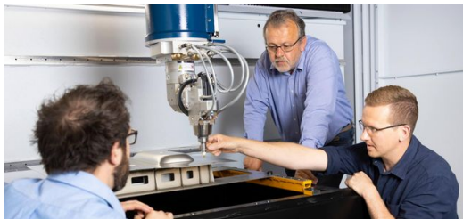
Discussing, arguing and seeking solutions together: the good cooperation between sons and father has taken the company a long way, on course for the Smart Factory.