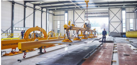
The Spanish eye-catcher cuts giant sheets and plates for truck bodies, ship hulls and buildings.

Two cutting heads dance across the sheet, cutting the specified shapes. Both of these optical systems are mounted on a single portal that moves over the sheet in the direction of cutting. As soon as a sheet has been cut, the roller gates ascend and the booth moves on to the next sheet. "This approach allows us to cut five or even ten sheets in one go, depending on sheet size."