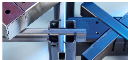
The TruLaser Tube 7000 cuts tubes and profiles with outer circle diameters of up to 254 millimeter. Complex calculations at corners of rectangular profiles are automatically handled by the TruTops Tube software. Picture: