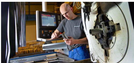
Each day one or two of the programmers are fully occupied with preparations for two-shift operations. The TruTops Tube Software makes possible exact calculation of cutting geometries.