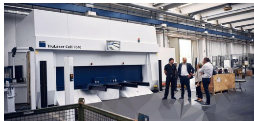
The TruLaser Cell 7040 in the production hall of Omas S.p.a.