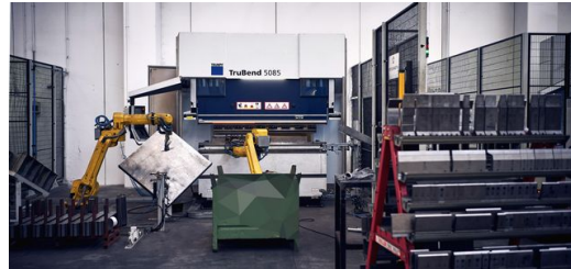
Robot colleague: For the employees at Omas S.p.a., robots have long been part of everyday life.