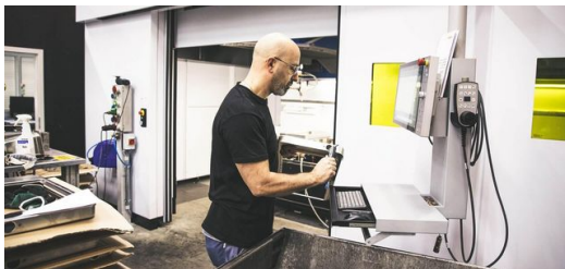
Rieber is a leading supplier of kitchen technology for restaurants and private households. But the company from Reutlingen also produces components and assemblies made of stainless steel and titanium for the aerospace industry. Quality is particularly important here.