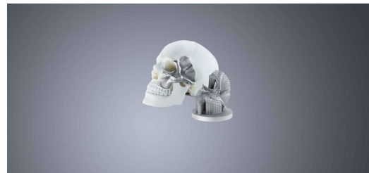
Automated monitoring solutions are indispensable especially in strictly regulated sectors such as medical technology.