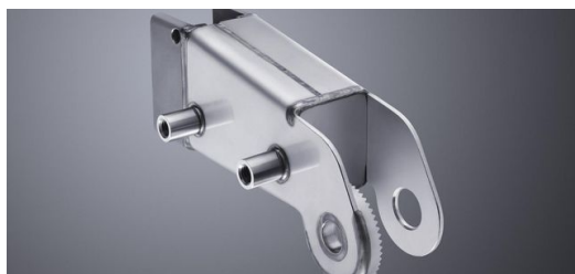
TRUMPF Medizin Systeme setzt in der OP-Tisch-Fertigung auf die Pluspunkte vom Laserschweißen.

This article was first published in May 2014.