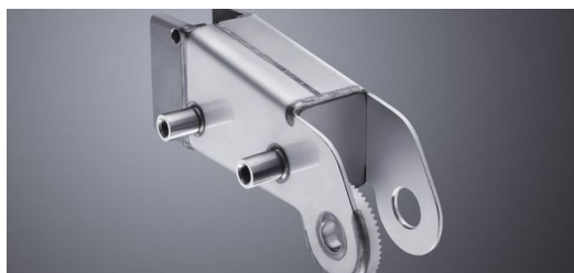
<p> TRUMPF Medizin Systeme setzt in der OP-Tisch-Fertigung auf die Pluspunkte vom Laserschweißen.</p>

This article was first published in May 2014.