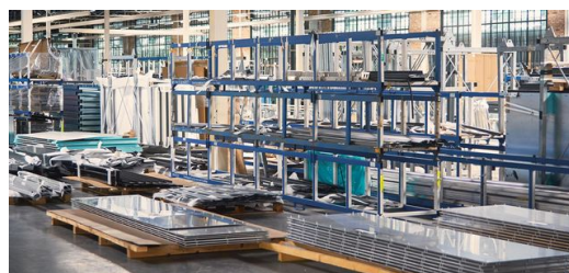
<p>A one-stop service provider: KFK set up its own glass production facility measuring approximately 360 meters long in 2017.</p>