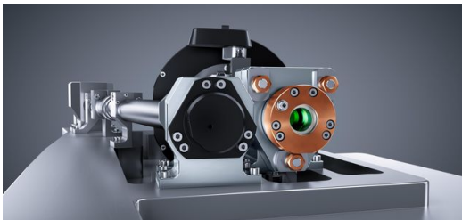
Optics of the new TruDisk lasers by TRUMPF

I had just come back from a conference on solid-state lasers. One of the sessions focused on the active laser medium Yb:YAG. The presenter was tremendously enthusiastic about this highly promising material that could be used to build beam sources for high-power lasers if only a way could be found to cool the material sufficiently, a problem that seemed insurmountable at the time. And I couldn't get that thought out of my mind.