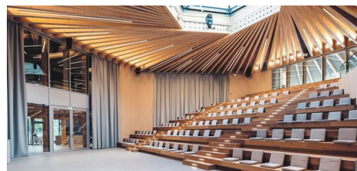
Flooded with light: To encourage listeners to engage with each other, the auditorium in the new training center features long rows of seating instead of chairs.