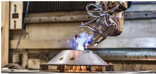
ELFIM uses the Lasercell 1005 for various applications of laser technology such as 2D and 3D cutting or welding and also for laser metal deposition.

perform a 3D scan of an existing replacement part.