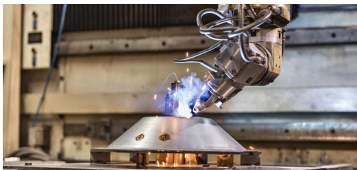
ELFIM uses the Lasercell 1005 for various applications of laser technology such as 2D and 3D cutting or welding and also for laser metal deposition.

perform a 3D scan of an existing replacement part.