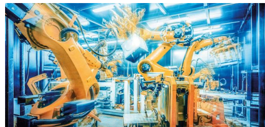
In manufacturing Industry 4.0 will lead to an unprecedented push for flexibility. Optical sensors and measurement devices will provide the data needed.