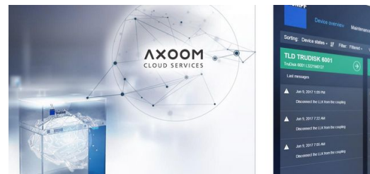
Some of the data is uploaded to the AXOOM Cloud via the Internet.