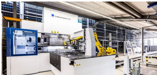
The TruBend Center 7020 with Starmatik robot automation is connected to the fully automatic STOPA warehouse. Employees are only required for the provision of empty pallets and the removal of loaded pallets.