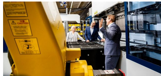
The Starmatik robot automation system for loading and unloading the TruBend Center 7020 speeds up production.