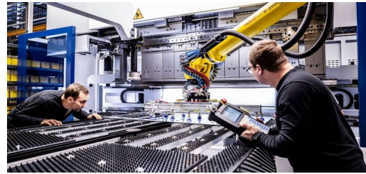
Autz + Herrmann mainly processes thin sheet metal. The low-pressure suction cups of the Starmatik robot automation system pick up blanks very gently.