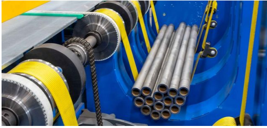
TruLaser Tube 7000