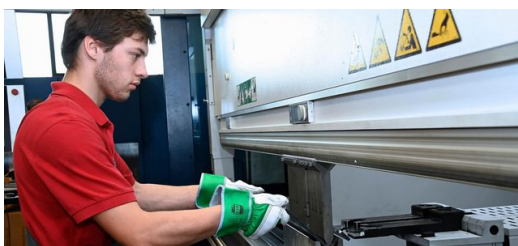
<p><span lang="EN-US">Assistance systems and software help with the work: The TruBend 5230 in use at the Fischer company.</span></p>