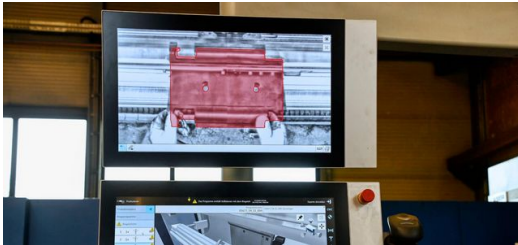
The Part Indicator in action: The system immediately shows whether the bending part is positioned correctly or incorrectly. Red means there is still an error here.

"The ACB Laser works with very high accuracy," says Fischer. Whether thin or thick sheet, a batch size of 1 or series parts, "If you load the program, the process runs." The operator uses the ACB Laser optical system for angle measurement without having to retool. A duo of laser and camera each travel independently along the desired bend. The laser projects a corresponding line onto the bending part, and the camera recognizes the line and calculates the angle of the part in real time.