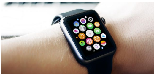
Smart watches are another intelligent companion.

Not only does this new cutting technique give manufacturers the opportunity to dispense with expensive intermediate steps in today's industrial display screen manufacturing processes. It also allows the process to be reorganized. Because the laser cuts hardened glass quickly and without touch-up work, the future could see processing steps such as hardening, coating and structuring being carried out at a greater scale, on large panels. Lasers could then cut the large panel into smaller sections at the very end of the process.