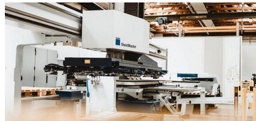
Automation: The SheetMaster supplies the TruPunch 5000 with the required material. This increases efficiency and takes the pressure off employees.