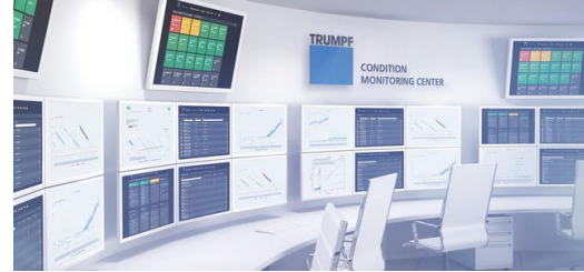
Algorithms and real TRUMPF experts then set to work transforming the data into trend analyses.