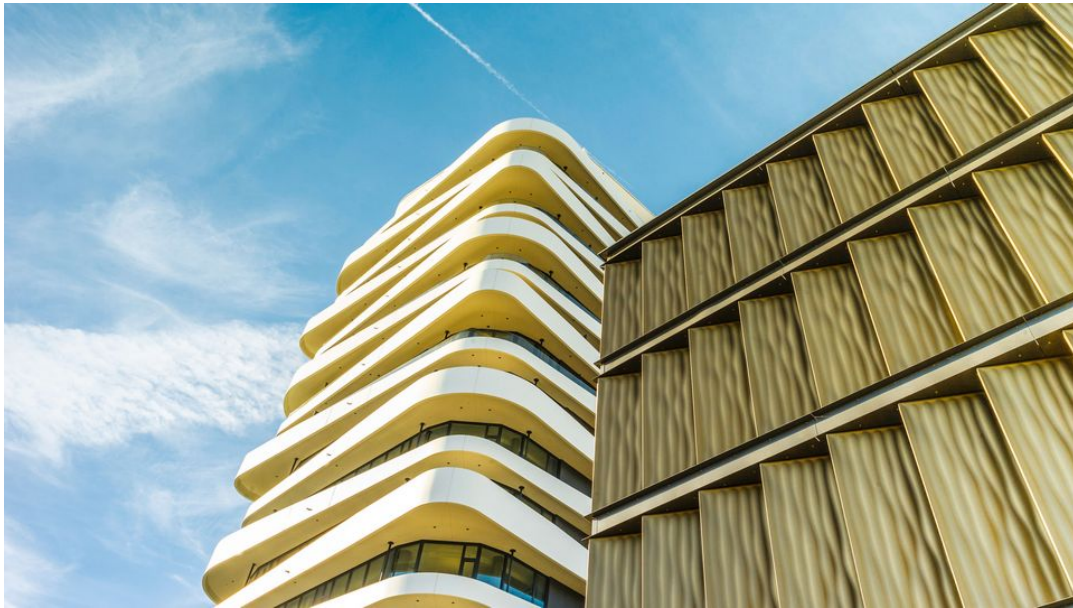
Multistory parking garage in Bietigheim-Bissingen