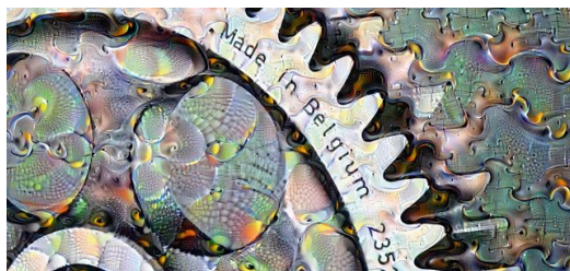
The dream in the workpiece?