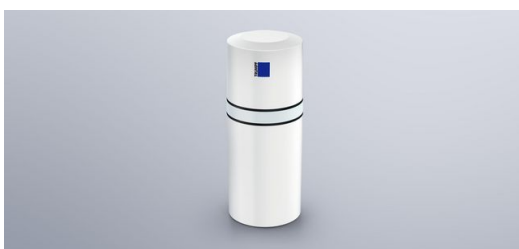
Satellite: Satellites installed in the production facility pick up the markers' location and transmit the information to an industrial PC.