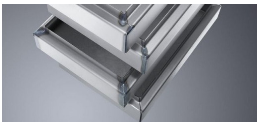
Mild steel terminal box (from bottom to top): unwelded, manual MAG weld, FusionLine weld, and laser weld after redesigning for laser processing.

What is more, the FusionLine function allows operators to join components that are not optimized for laser welding and, for instance, to uncover cracks. The results obtained with FusionLine far exceed conventional welding both in terms of the weld seam quality and the speed of execution.