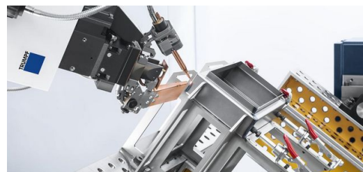
The FusionLine joining technique can be used to join parts, even when this involves the bridging of gaps. It smooths out any unevenness during the welding process and closes gaps up to one millimeter wide. That makes it possible to use the laser on many parts that were originally designed for conventional welding methods.