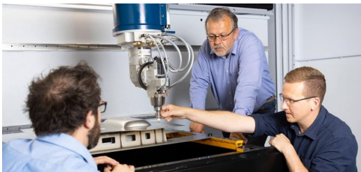
Discussing, arguing and seeking solutions together: the good cooperation between sons and father has taken the company a long way, on course for the Smart Factory.