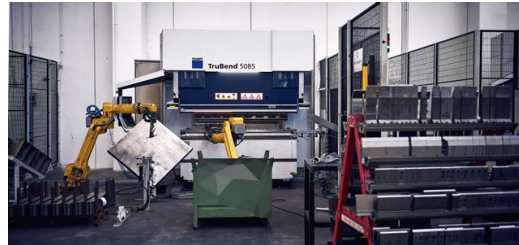
Robot colleague: For the employees at Omas S.p.a., robots have long been part of everyday life.