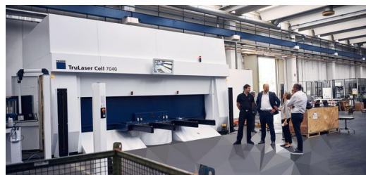
The TruLaser Cell 7040 in the production hall of Omas S.p.a.