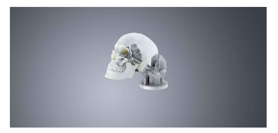
Automated monitoring solutions are indispensable especially in strictly regulated sectors such as medical technology. _ TRIIMPF