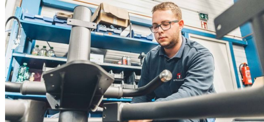
<p>The frame of an EGYM exercise machine consists of primarily oval tubes. After processing on a TRUMPF laser tube-cutting machine, it is given an elegant dark gray finish by powder coating.</p>