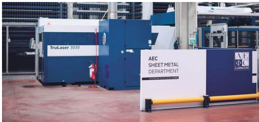
<p>The TruLaser 3030 fiber 2D laser-cutting machine laid the foundations of AEC Illuminazione's close partnership with TRUMPF. Its connection to an automated storage system made production much faster.</p>

and ensures smooth operation of the manufacturing environment. The design engineers can send their CAD drawings straight to the machines, where the data is imported and turned into finished parts as and when they are needed. The MES also collects machine data and key metrics for quality monitoring, machine utilization and production status. "By connecting everything together, we've created a truly transparent production environment. Tailoring our production schedules to the needs of our employees and machines helps to shorten throughput times and improve on-time delivery over the long-term," says Bianchi.