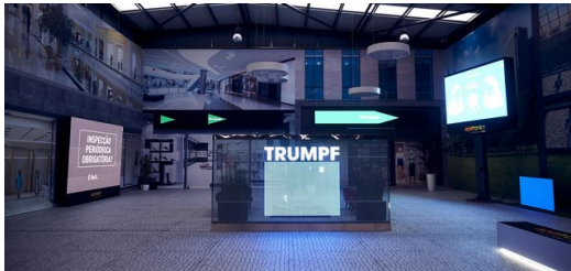
Authentic: Cobblestones in the showroom help provide an authentic atmosphere.