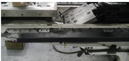
Before and after: old machine from TRUMPF before overhaul.

Predictive maintenance in machines is also a way of protecting the environment in sheet metal processing, because unplanned machine breakdowns in series production drives up the manufacturing carbon footprint. When machines suffer a drop in performance and this is not noticed in time, components already manufactured are often unusable and the company has wasted material. Predictive maintenance means machines send data about their condition digitally and in real time to a database. Irregularities are then automatically detected and the components responsible are identified. However, older machines are not always capable of transferring the relevant data to the database. TRUMPF therefore developed the " Smart Power Tube IoT Box " for CO 2 laser machines. This simple and inexpensive solution can also be used in older machine versions. Just a few easy steps are required for customers to install the box on the machine's laser generator. The solution then transmits data to TRUMPF with information about the machine's condition. If the monitored machine stops delivering the required performance, TRUMPF experts inform the customer, dispatch a genuine part, and arrange an appointment to carry out replacement work. This conserves resources and increases productivity.