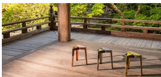
The "Orisu" chair is something special: it makes abstract technologies visible to the viewer.