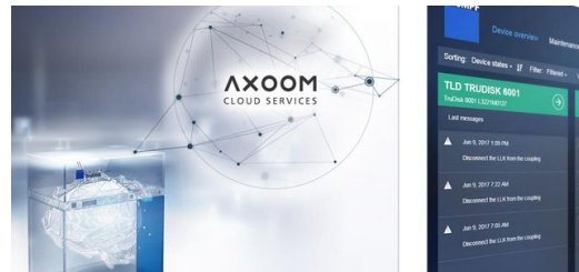
Some of the data is uploaded to the AXOOM Cloud via the Internet.