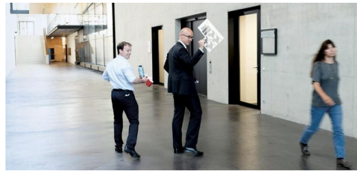
The team of people from the product group, development, purchasing, production, sales, service and project organization departments meets at regular intervals to discuss how development on the TruLaser Center 7030 is progressing.