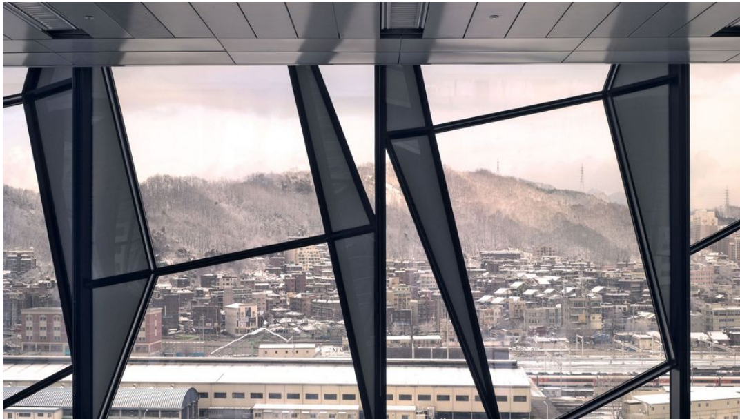
TRUTEK Building in Seoul, Korea.