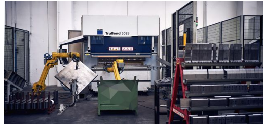
<p>Robot colleague: For the employees at Omas S.p.a., robots have long been part of everyday life.</p>