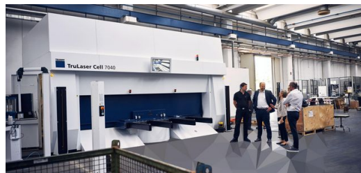
<p>The TruLaser Cell 7040 in the production hall of Omas S.p.a.</p>