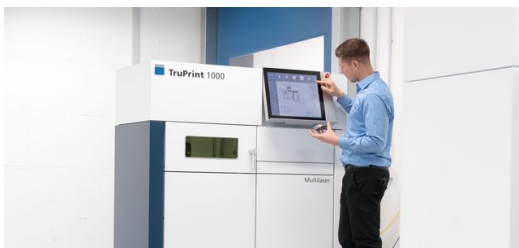
TruPrint 1000: TRUMPF's TruPrint 1000 3D printer