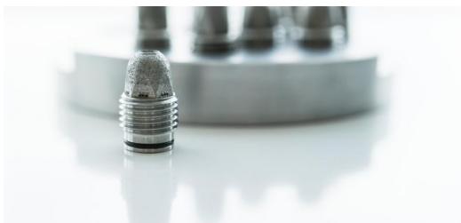
3D-optimized sewer cleaning system: This 3D-printed nozzle for sewer cleaning systems was optimized by TRUMPF.

TRUMPF experts set up a test bed to examine and validate the 3D-printed components. "Measurements have shown that this shortens the job time for conventional steps by 53 percent," says a clearly delighted Arikcan. The parts were made with the TruPrint 1000 3D printer; developed by TRUMPF, it features a single laser. This expert is confident that the time savings will be even greater with a multi-laser system. The new nozzles also deliver more persuasive performance with benefit of improved jet guidance. "We demonstrated that the water jet flows smoother than with the conventional design. We also expect the pressure on the surface to increase and water consumption to decrease," says Arikcan. Another positive side effect is that this boosts turning and milling stations' availability.