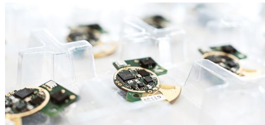
Ever smaller chips: A crucial part of the process.