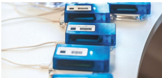
Prototype: What the markers looked like during the test phase.