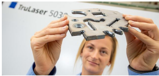
<p><span lang="EN-US">A worker checks a component she has chamfered using TRUMPF's EdgeLine Bevel technology. </span></p>