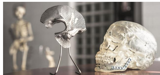
What the eye can’t see: the surfaces 3D printing can produce are the key to promoting a connection between the bone and the implant.