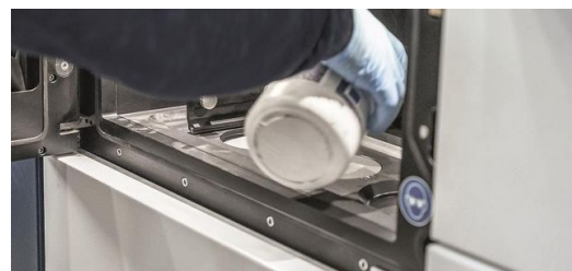
A healthy dose of powder: CONMET taps into the potential of 3D printing in two different ways. Firstly, to print custom-made implants and, secondly, to develop innovative mass-produced implants.