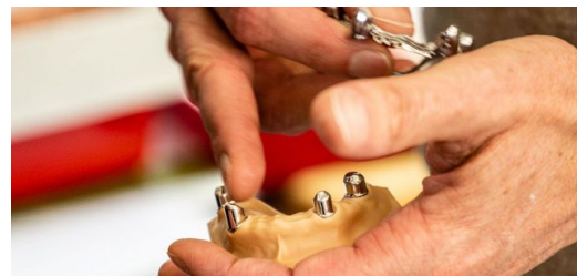
The primary coping (bottom) is cemented to the existing, prepped tooth stumps. The secondary crown, or female part, is connected to splints for the replacement teeth and placed on the primary coping.