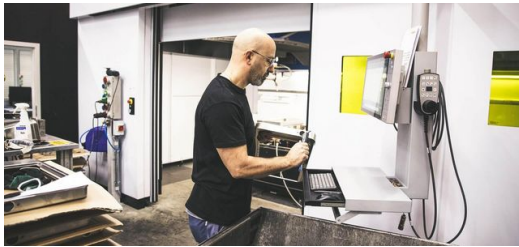
Rieber is a leading supplier of kitchen technology for restaurants and private households. But the company from Reutlingen also produces components and assemblies made of stainless steel and titanium for the aerospace industry. Quality is particularly important here.