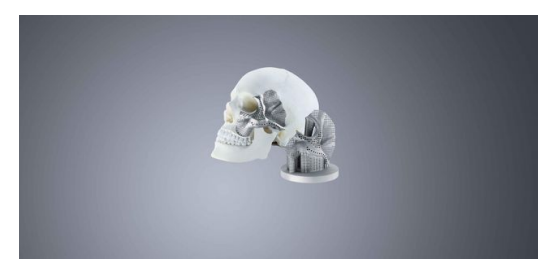
Automated monitoring solutions are indispensable especially in strictly regulated sectors such as medical technology. _ TRIIMPF