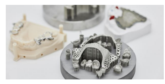
Dentures from the TruPrint 1000 3D printer from TRUMPF.<br />

For example, instead of relying on impression trays, CADSPEED offers its clients the use of so-called intra-oral dental scanners. These are manual scanners equipped with sensor systems, which dentists can use to digitally map the patient's mouth in 3D. This data can then be processed further directly, negating the need for a plaster cast. As a result, the whole process is faster, more affordable, and more precise.